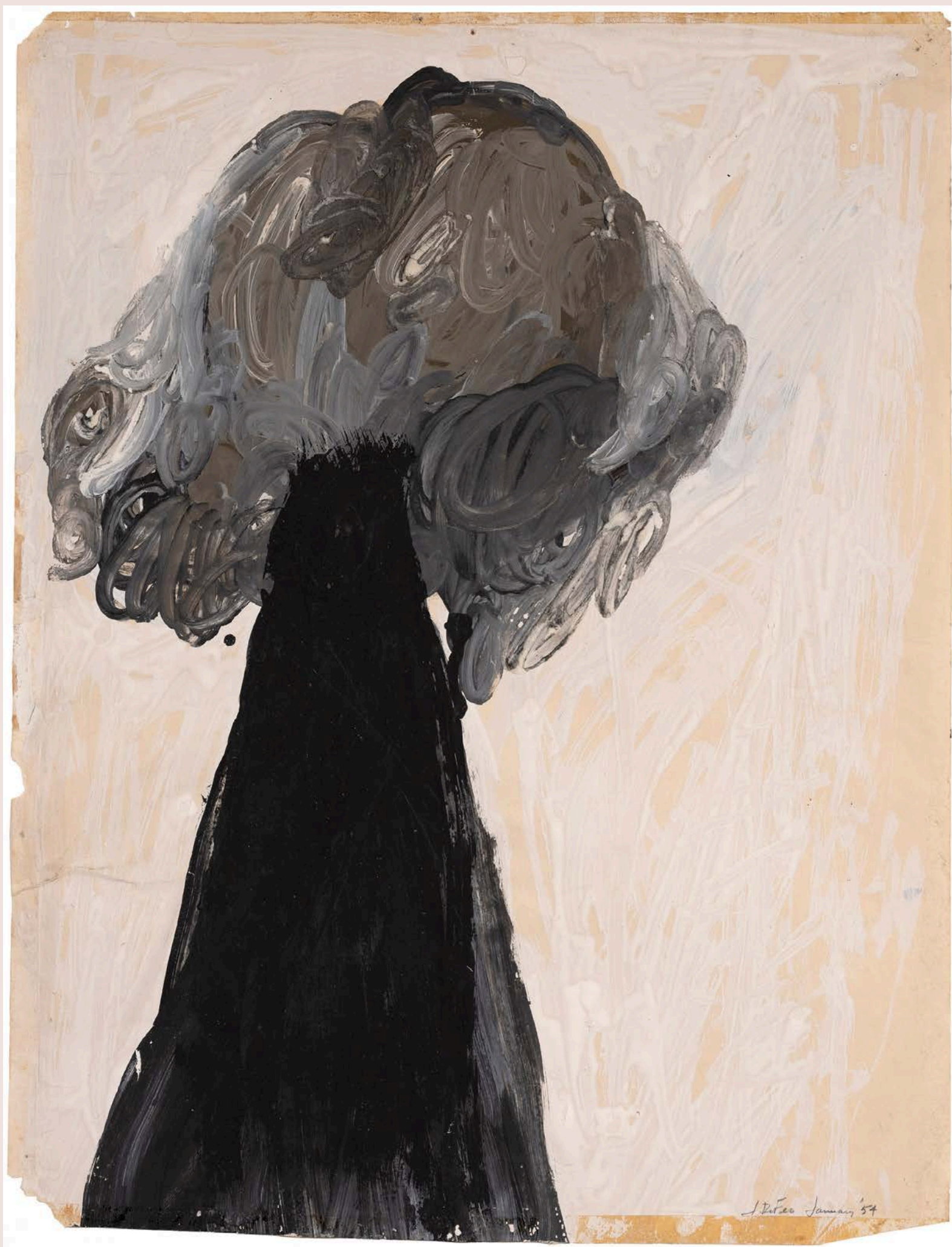
Jay DeFeo, Untitled ( Tree series ), 1954. Tempera on paper, 15 1/4 x 11 3/4 inches (38.7 x 29.8 cm). JDF no. E1408. The Jay DeFeo Foundation, Berkeley © 2024 The Jay DeFeo Foundation/Artists Rights Society (ARS), New York.